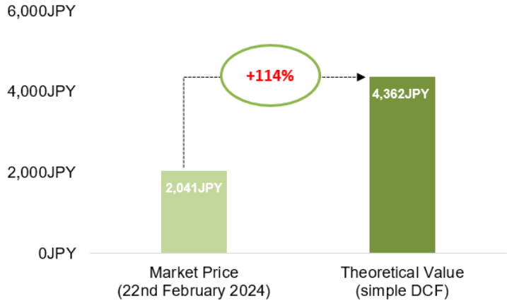
Figure 3: Our Estimate on AlphaPolis Intrinsic Value per Share

Firstly, here is our view on your company's intrinsic value per share. Base on a simplified Discounted Cash Flow (DCF) calculation with unstretched assumptions, we expect the AlphaPolis intrinsic value to be around 4,300 yen per share which is 110% higher than a closing price of 2,041 yen on February 22nd, 2024.